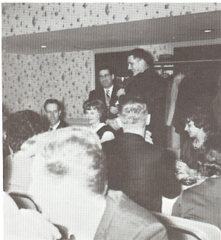
Most effective speaker.