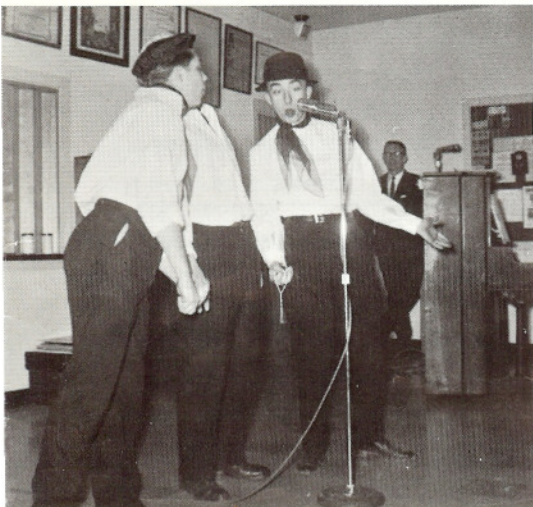
Those guys again!