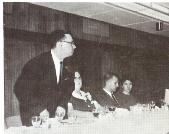
What did he say?

Opening night "jitters" if present at the start, soon vanished in the warm glow of friendly, happy fellowship. It is from such association as this, that the words Christian and fellowship are joined together and take on a new, truly meaningful significance.