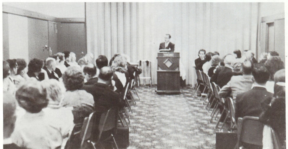
Evaluating the Saturday Nite Club.

The birth of each new nation somehow finds Uncle Sam the babysitter.