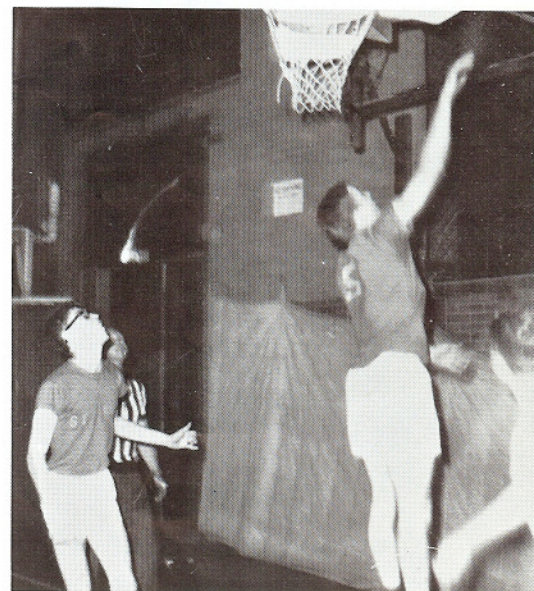
A one hander!

A generation ago most men who finished a day's work needed rest; now they need exercise.