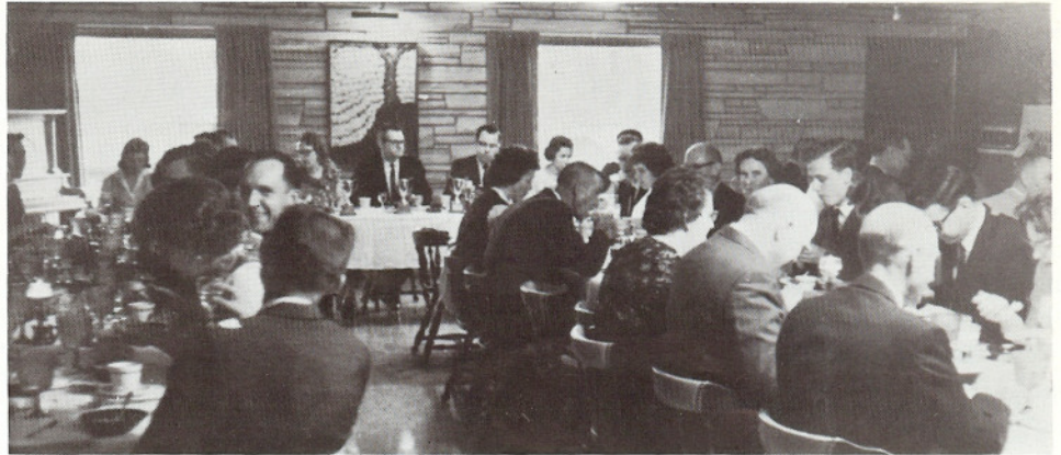
Wichita Spokesmen meet and eat!

We certainly hope that he will return soon and be with us again.