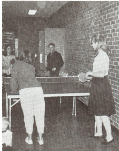
Ping for serve.

After the show, various games were set up for the children, and they thor-