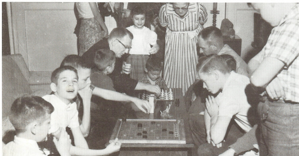
Fun and games!

The trouble with dropouts is not that they cannot see the handwriting on the wall, but that they cannot read it.