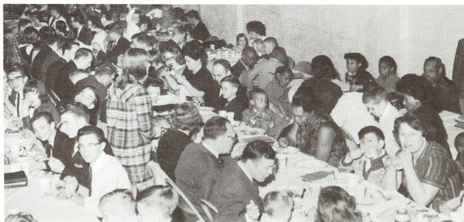
Enjoying the physical food.