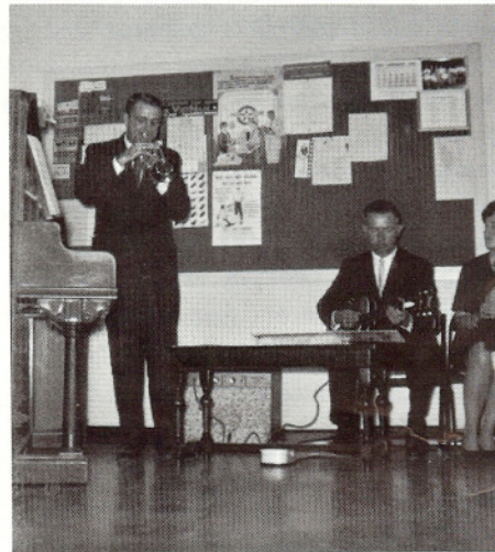
A hot combo!

It was probably our last social for this season. But there are many diversions to help us lead a balanced life.