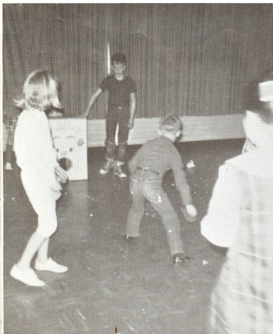
"Bean bag bowling."