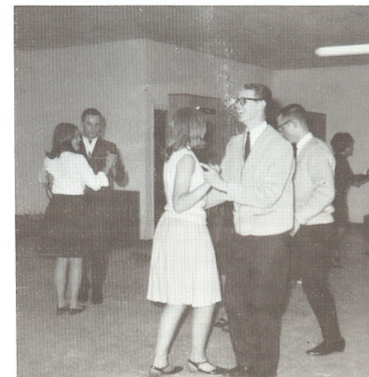
Soft shoe shuffle.