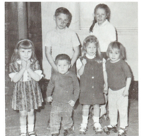
Ready to roll.

We were thankful we have this opportunity for exhilarating exercise, amusement, and fellowship.